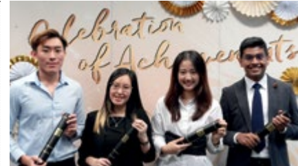
In 2022, the University of London awarded SIM GE students with 35 awards for achievement and 80 commendations, 37 were also recognised for topping the world in their modules.

SIM GE is part of the University of London's global network of teaching institutions. It has been awarded the highest status of Affiliate Centre in recognition of its commitment to high quality teaching and support to students.